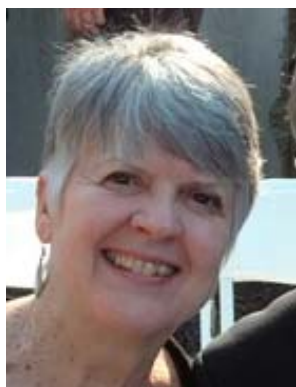
Jackie Green, Minister of Youth and Family

Knowing that we all live in an abundant universe, we are blessed to be a blessing.