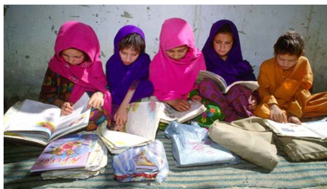
Kashmiri refugees in school. Pakistan.